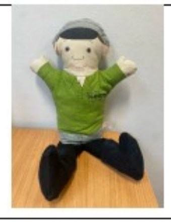
Problem Solving Percy