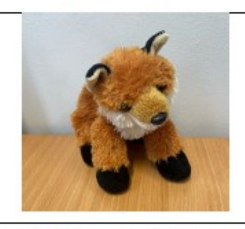
Finding Out Fox